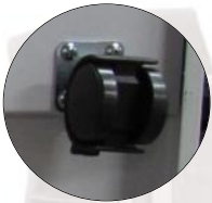
Locking Castors Front of Unit