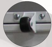
Sturdy Drawer Support Wheel (Prevents Unit Tip)